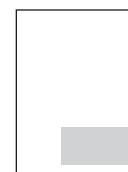
1/6 Horizontal 4.5h x 2.375w