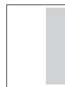
1/3 Vertical 9.75h x 2.375w