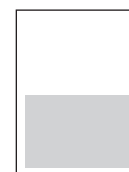
1/2 Horizontal 4.6875h x 7.5w